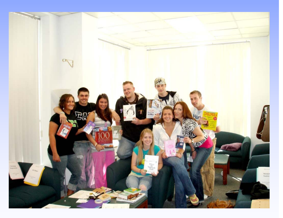
Order of Omega Students: NEA's Books Across America Initiative