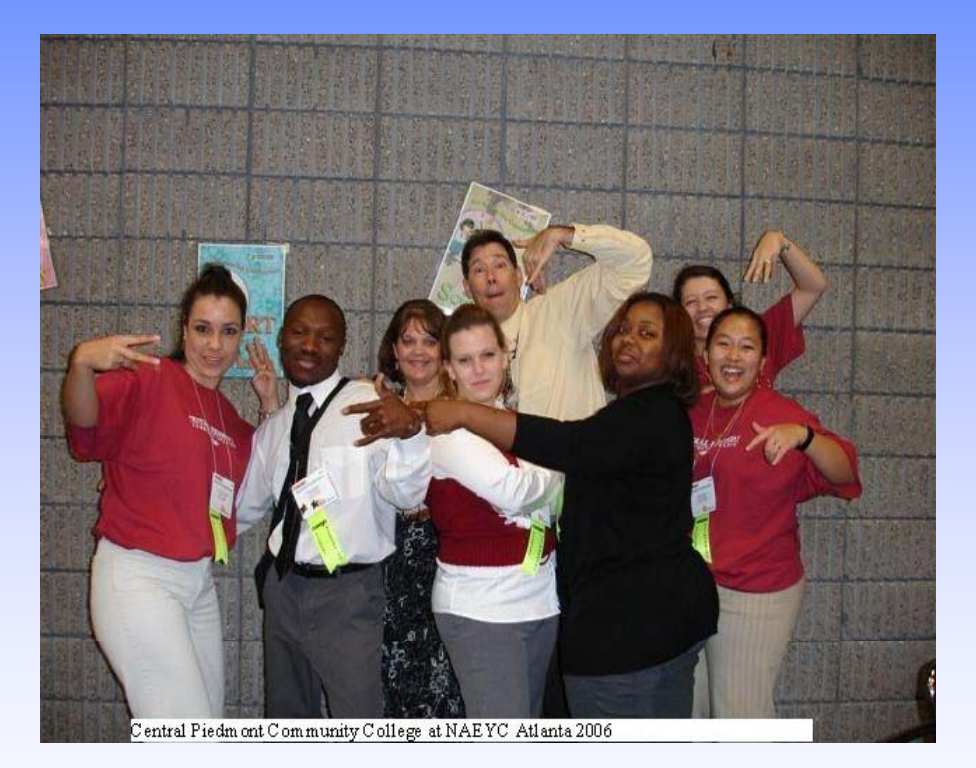
"Posse" Shot, NAEYC Atlanta

Tulsa Community College faculty and students presented, in Chicago! "Innovations in ECE Student Organizations and Affiliate Groups: Leadership Development that Results in Professional commitment for All Generational Cohorts".