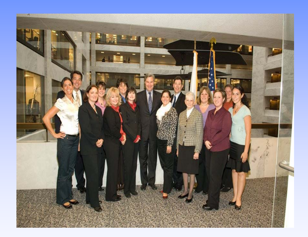
Photo: Johnson & Wales Graduate Students with Senator Whitehouse in the U.S. Senate Building